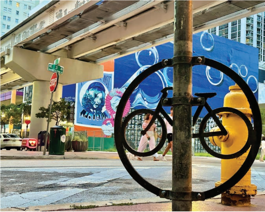
Evelyn Chyr, "Miami Street"