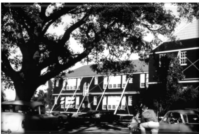
A student leans on his car in front of the Highway School, which was the temporary home of Foothill College from 1958-1961.